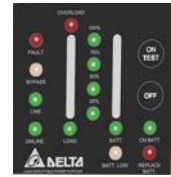
Friendly LED Display

* Lower range 80 ~ 176 Vac is acceptable under 50 ~ 100% loading condition. All specifications are subject to change without prior notice.