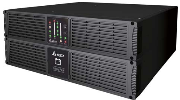
Series Comparison (1-3 kVA)

The Amplon R series is designed for long backup time applications with the addition of a customized battery source. The inbuilt high level charger shortens the recharging period and increases availability.