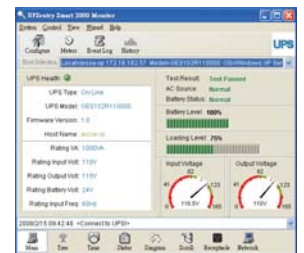
Power Management Software