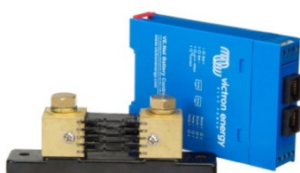
VE.Net Battery Controller

No prescaler needed. Note: RJ45 connectors are galvanically isolated from Controller and shunt.