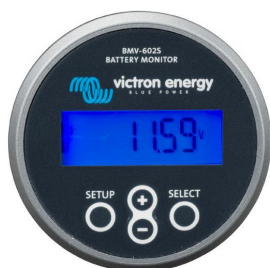
BMV 602S Black