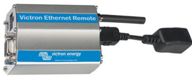
Victron Ethernet Remote