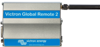
Victron Global Remote 2

The Ethernet Remote has the same functions as the Global Remote. An extra function of the Ethernet Remote is that it can connect with LAN, due to a special cable. In this way, the Ethernet Remote can be connected to the internet without a SIM-card.