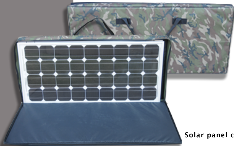
Solar panel carry bag: