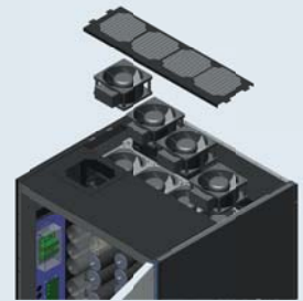
Hot-swappable and Redundant Fan