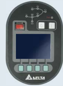
Control and LCD Display Panel

* When input voltage is 242 ~ 324/140 ~ 187 Vac, the sustainable loading is from 70% to 100% of the UPS capacity. All specifications are subject to change without prior notice.